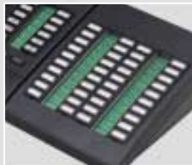
20- or 40-key versions Maximum 2 modules