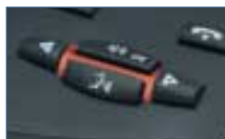
Audio control keys

Audio control functions (loudspeaker volume control or hands-free audio control, mute, etc) are separated from the system's function keys to facilitate easy and clear audio control for the user.