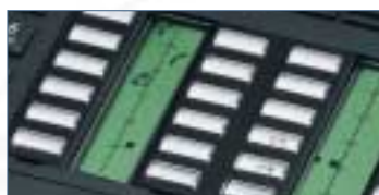
Labels you can customize. Large transparent keytops

Programmable system or user keys are available on the Alcatel Reflexes™. Labelling can be standardised at a corporate level and/or defined by the user. Determining the status of a call is simple with the help of easy to understand icons that replace the complex combination of LED cadences. Reading the label associated with each key is simple because the key top is equipped with a built-in lens that magnifies the key label. This key top is a patented Alcatel feature.